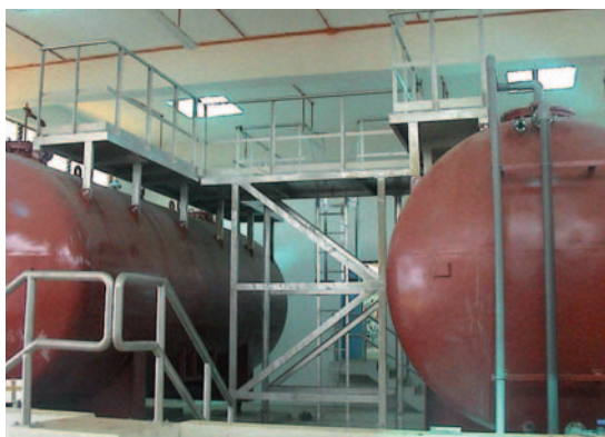
Alum tanks and platform for Lancang Treatment Works and Bulk Transfer Project in Malacca.

In line with the Government's emphasis on water as a core sector of the Malaysian economy, potable water and sewerage were placed under a new ministry for Energy, Water and Communications in March 2004. The role of the new ministry is to facilitate and regulate the growth of the energy,