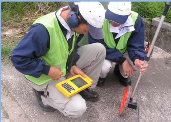
Leak noise correlator - equipment used in NRW control to pinpoint leaks.