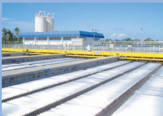
Lamella Clarifier installed at Kepong 3 Water Treatment Plant, Kuala Terengganu

Our wastewater division, Envitech Sdn Bhd contributed 35% of the Group's turnover in the current financial year as compared to 22% in the past year. Our expansion into this important market is indeed timely and opens new opportunities for growth. Taking advantage of water achievements overseas, the Group is also exploring wastewater and sewerage opportunities abroad especially in China.