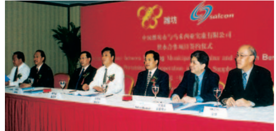
Signing ceremony of The Head of Agreement between Salcon and the People's Government of Linqu County, Anqiu City, Qingzhou City and Changyi City, Weifang Municipality, Shandong Province, China pertaining to investment in the water supply systems in the above counties/cities in September 2003.

In Thailand, Salcon successfully completed the construction of the Min Buri Water Distribution Pumping Station in Bangkok for the Metropolitan Waterworks Authority (MWA). 2 other projects are also progressing smoothly ie Supply and installation of trunk mains, Contract no. PIT 711 and the construction of Sam Lae raw water pumping station no. 4, both in Bangkok.