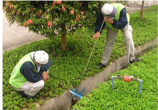
Leakage detection team using listening stick to detect leaks.

With the formation of the new Ministry, the National Water Services Commission will also be formed to act as a Regulator to ensure a balance between the various stakeholders in the water and wastewater industry.