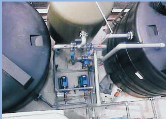
Top view of the backwash system for Central Sugar Refinery Wastewater Treatment Plant located in Shah Alam, Selangor.