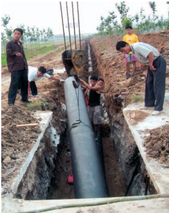
Pipe laying works to new townships for the Changle water supply concession.

Several framework agreements with four counties/cities in Shandong and Kunming in Yunnan were also signed. We are working towards the commencement of construction works for some of these cities in the financial year 2004/05.