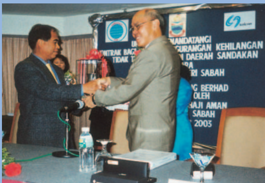
Signing of NRW Reduction Contract for Sandakan District, Sabah.

After 29 years of successful operations, Salcon was listed on the Main Board of Kuala Lumpur Stock Exchange (now known as Bursa Malaysia Securities Berhad) on 3 September 2003. It was an exciting and eventful beginning, filled with expectation, arising from our newly listed status and the Malaysian government announcement of transfer of water management from the State to the Federal Government.