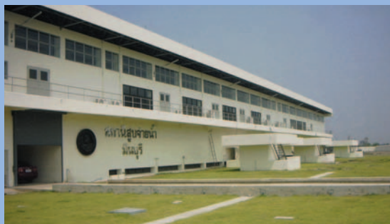
Elevated view of the Minburi Pumping Station in Bangkok, Thailand.

Against the backdrop of strong Malaysian macro-economic fundamentals and a broadly-balanced economic structure the Board is optimistic that the Group will perform satisfactorily in the financial year ahead and the outlook for the Group for the next few years remains strong.