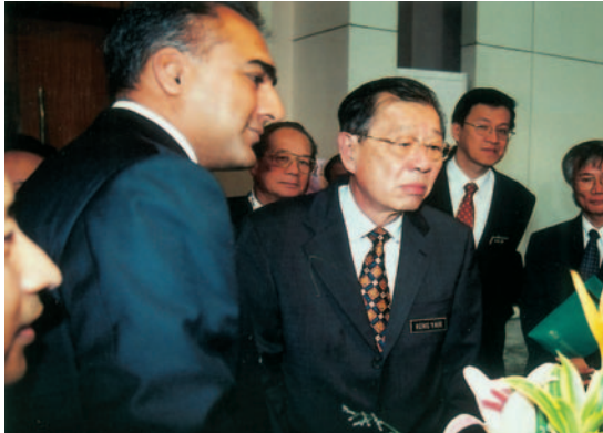
Minister of Energy, Water and Communications, Dato' Seri Dr Lim Keng Yaik during his visit to Salcon's booth at the Asiwater 2004 Exhibition in the MINES, Kuala Lumpur.