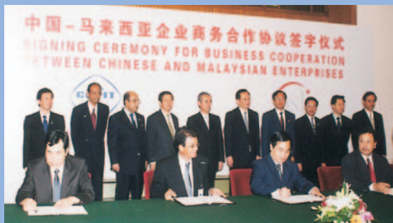
Signing of Head of Agreement between Salcon Berhad and the People's Government of Weifang Municipality pertaining to investment in the water supply system in Weifang Municipality, Shandong Province, China witnessed by YAB Prime Minister.

records, we are confident of meeting the challenges arising from the ongoing structural changes carried out by the new Malaysian Ministry of Energy, Water and Communications.