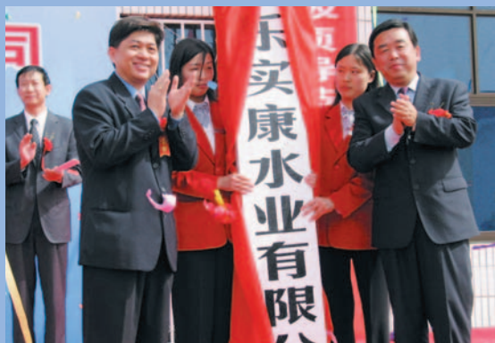
Opening ceremony of Shandong Changle Salcon Water Co. Ltd. in April 2004.

In continuation of Salcon Engineering Berhad good dividend payment record, the Board is recommending a final tax-exempt dividend of 2.6 cents per share for the financial year ended 31 July 2004, subject to the approval of the shareholders at the Annual General Meeting amounting to total dividend payout of RM5.0 million.